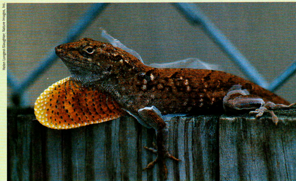
Helen Longest Slaughter, Nature Images, Inc.

The brightly colored and often strikingly distinct dewlaps also serve as species ID cards. For example, the dewlaps of the Cuban base-of-the-tree anoles are unmistakable: one is white, another is orange with yellow spots, a third is red with a white rim, and the fourth is yellow with big splashes of red. Laboratory experiments show that male anoles will ignore males of their own species that have had their dewlaps painted a different color (with removable lipstick) but will react aggressively toward males of other species whose dewlaps have been colored to resemble their own.